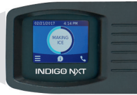
Indigo NXT Series iT420 Ice Machine on D320 Bin