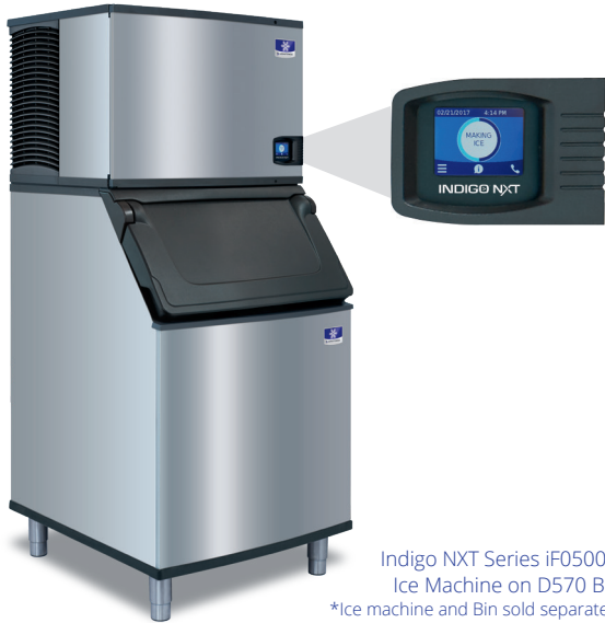
Indigo NXT Series iF0500N Ice Machine on D570 Bin *Ice machine and Bin sold separately

Designed for operators who know that ice is critical to their business, the Indigo NXT Series ice machine's preventative diagnostics continually monitor itself for reliable ice production. Improvements in cleanability and programmability make your ice machine easy to own and less expensive to operate.