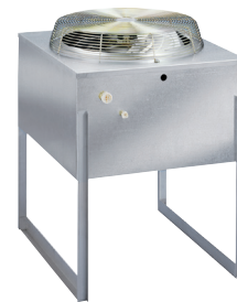
Standard air-cooled remote JCF0500-161

Remote Ambient Operating Temperature: -20 to 120F (-29C to 49C)